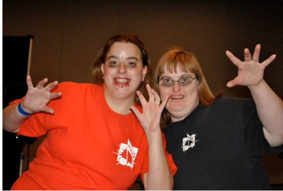
Superstar Dance Team getting ready for Thriller.

At the event, one of our parents asked me, "Why do you keep raising money all the time? Aren't you all volunteers? Why can't you just get everything donated?"